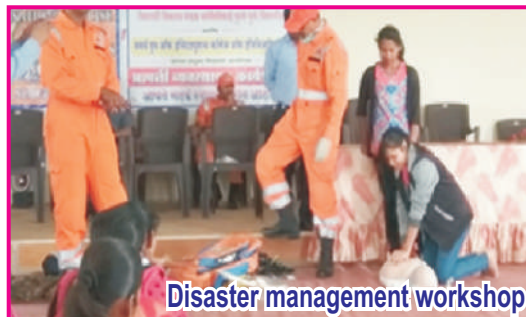
Disaster management workshop