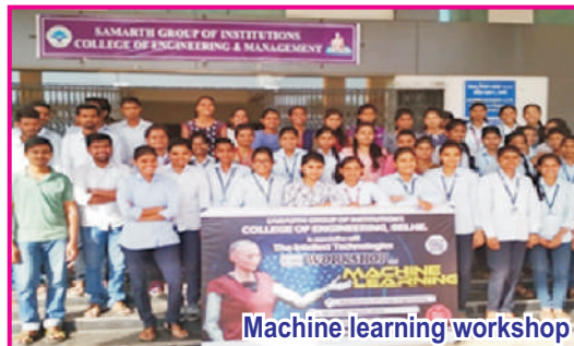
Machine learning workshop